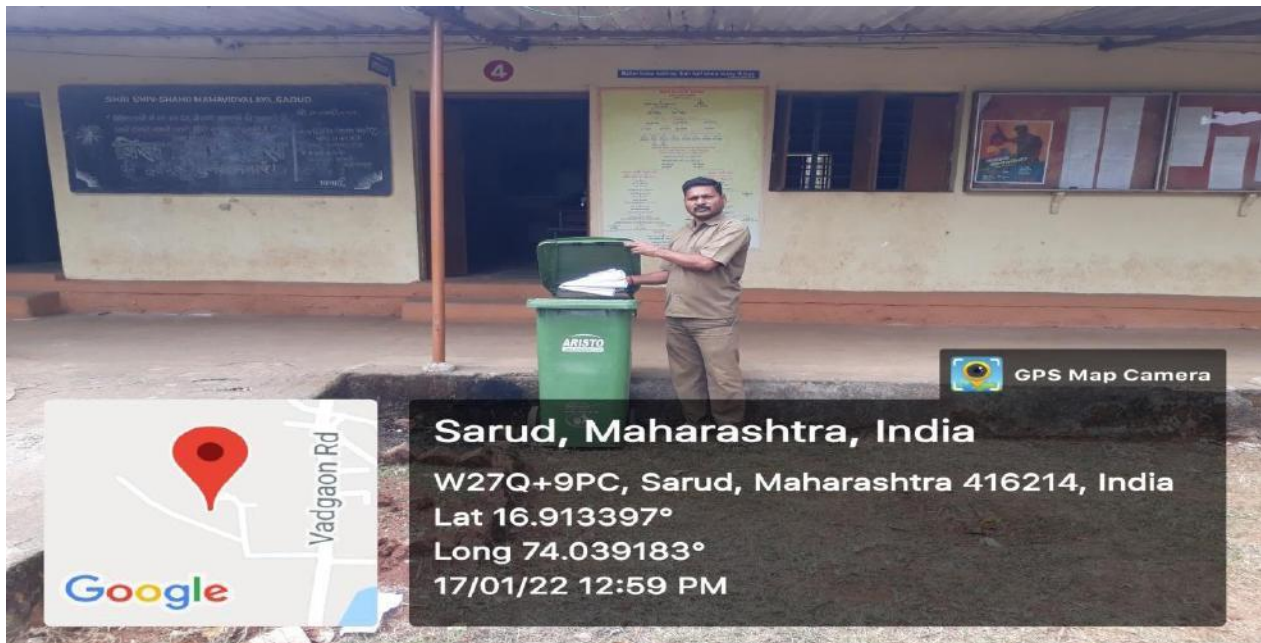
Dust bin near Staff Room