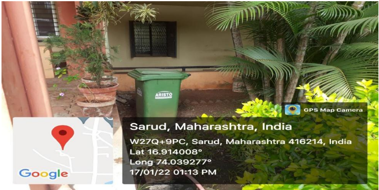
Dust bin in front of Sanstha's Office