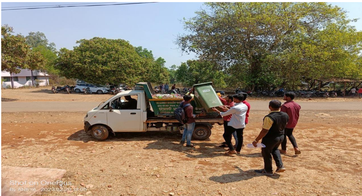
NSS Students volunteering to load waste