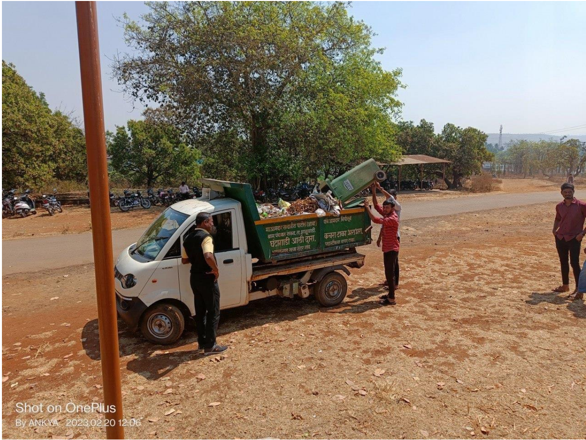
NSS Students volunteering to load waste