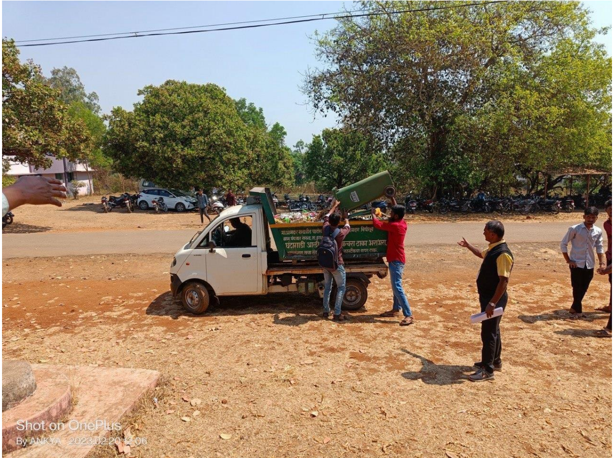
NSS Students volunteering to load waste