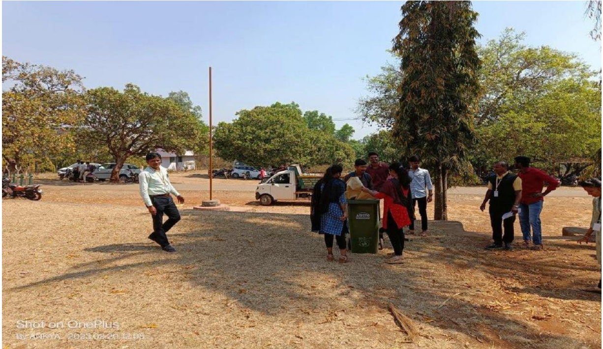
NSS Students volunteering to load waste