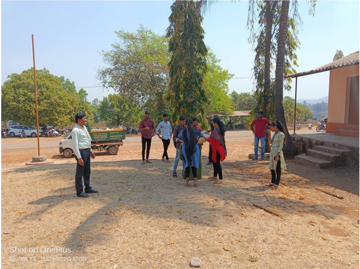
NSS Students volunteering to load waste