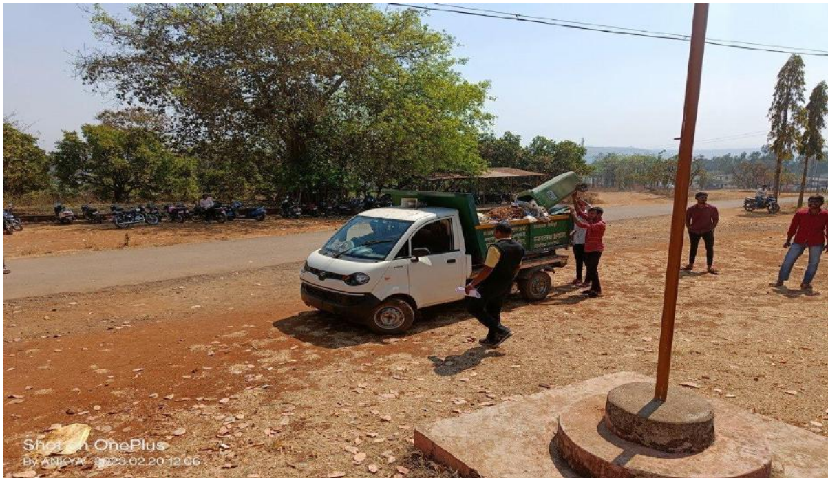
Sarud Grampanchayat employees collecting waste from college campus