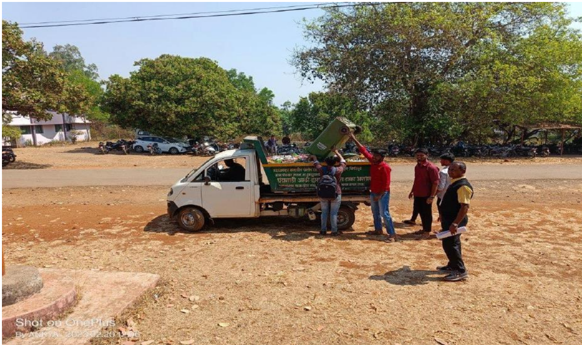
NSS Students volunteering to load waste