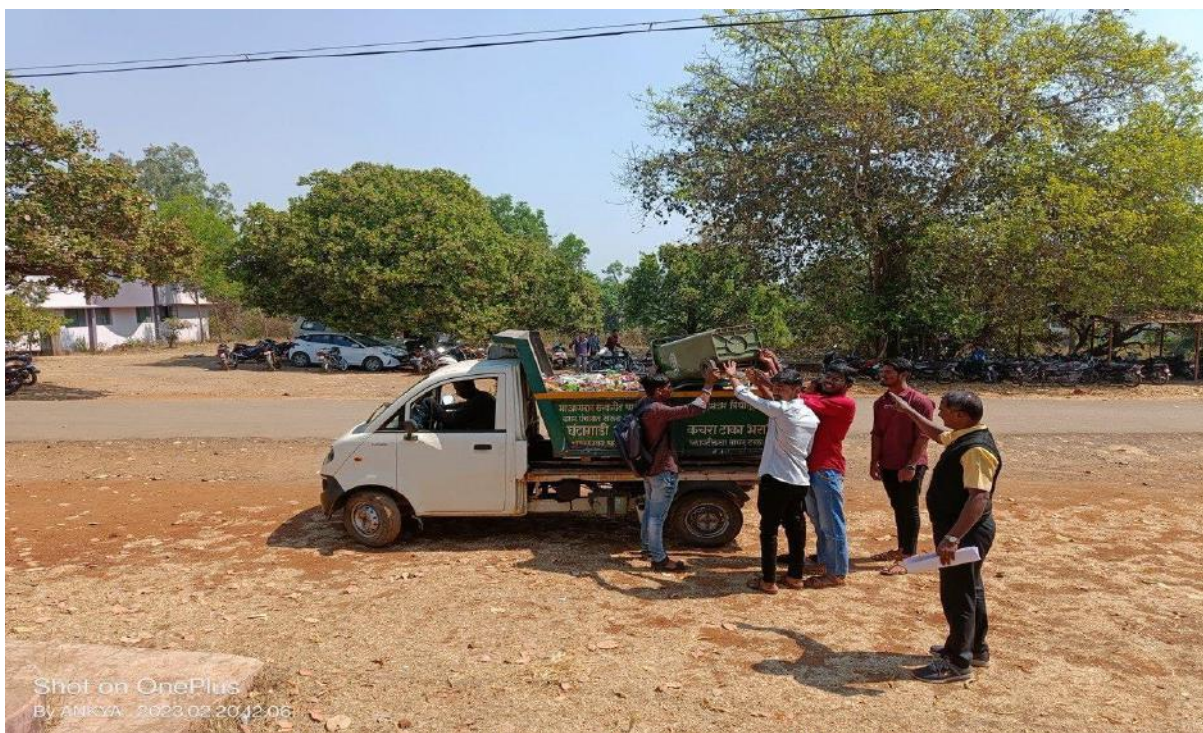
NSS Students volunteering to load waste