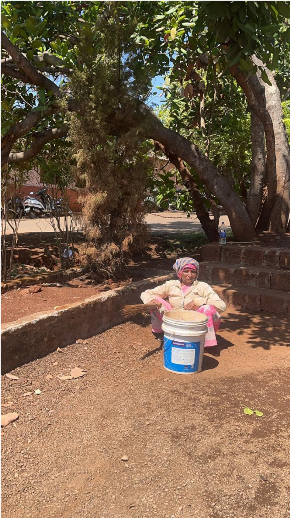
TWO APPOINTED WORKERS FOR CLEANING THE CAMPUS