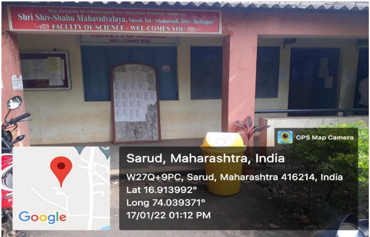
Dust bin in Science Wing