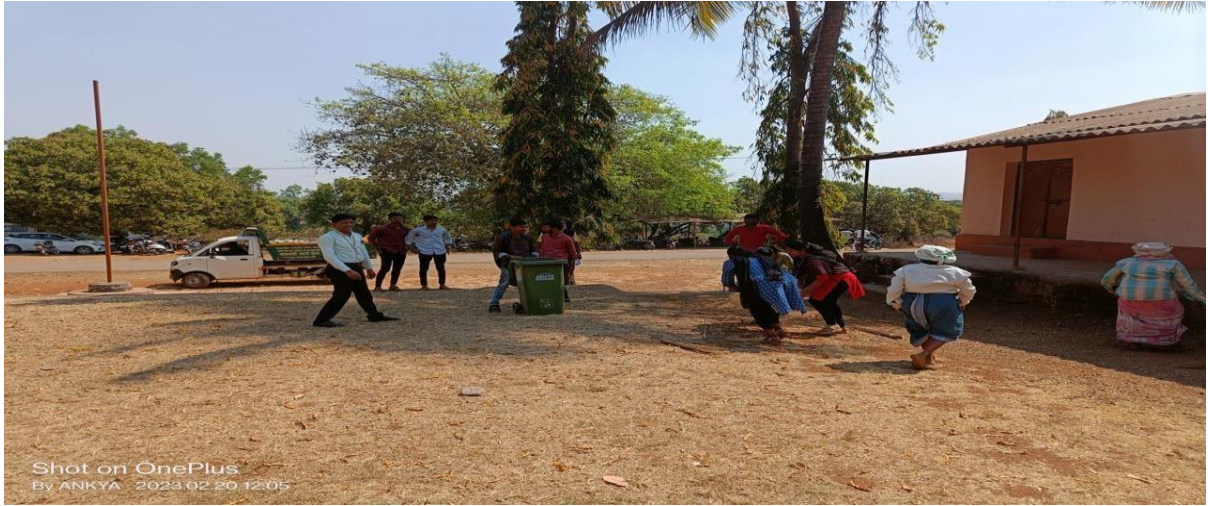
College students collecting waste